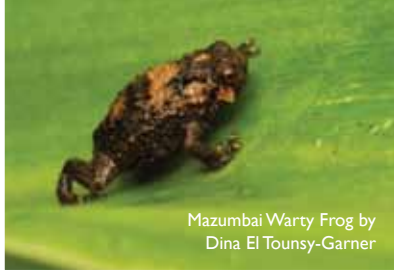
Mazumbai Warty Frog