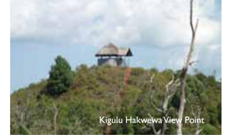
Kigulu Hakwewa View Point

The Eastern Arc is a chain of ancient forested mountains stretching across Tanzania and into Kenya. Many unique species thrive in these isolated massifs, including over 500 plant species and numerous animals that are found nowhere else on earth. Acre for acre there are more unique plant and animal species in the Arc than anywhere else in Africa, and the area is considered one of the planet's most important biodiversity hotspots. Between the 13 Eastern Arc mountain blocks, the West Usambara mountains are the third in importance with respect to endemic plant diversity.