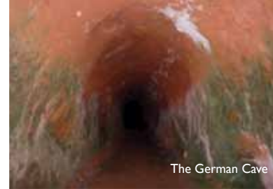
The German Cave