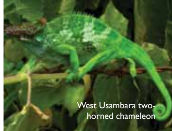
West Usambara two- horned chameleon